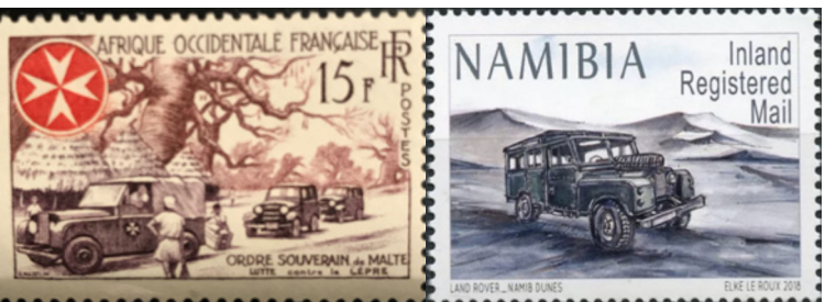
Ottawa Valley Land Rovers October 2018 Newsletter

But, since we need an image or two, these two stamps represent the first postage stamp with a Land-Rover on it, and the second is the most recent postage stamp with one.